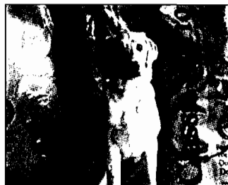
Food Donated to the "Miracle Fund"