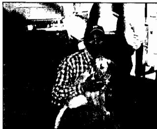
Miracle at Jitters