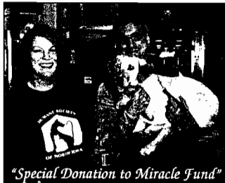
Miracle at Wayne's Ski & Sports